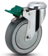
Direction Lock Green pedal.