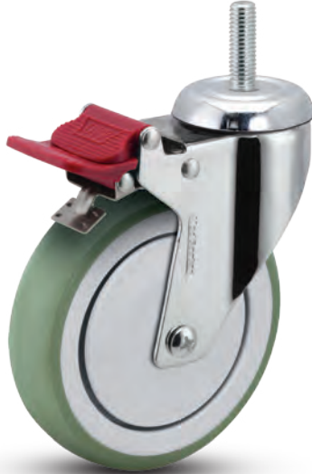
Anti-microbial TPR wheel with total lock SX-05AMX-125-TL-TS02