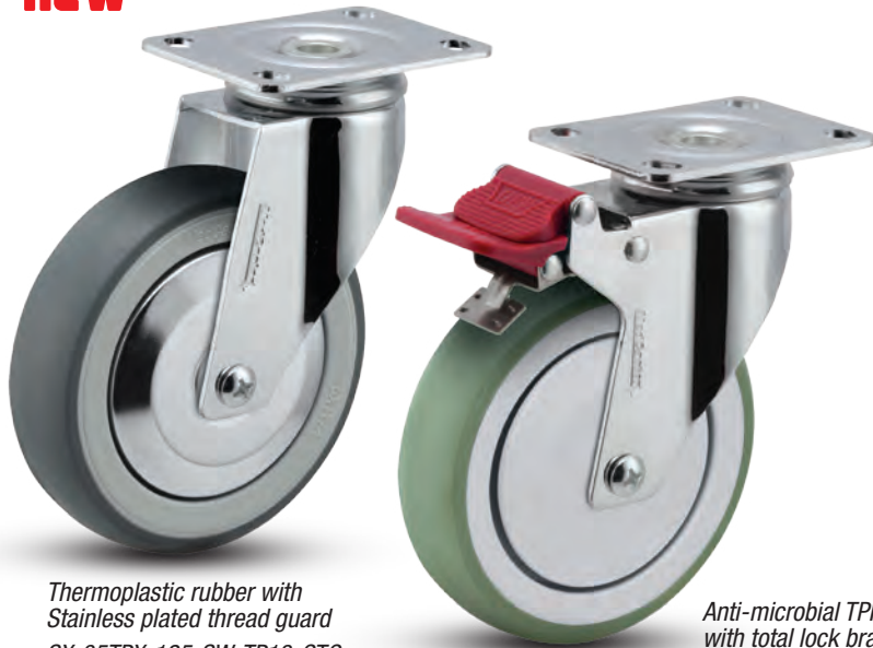
Thermoplastic rubber with Stainless plated thread guard SX-05TPX-125-SW-TP13-CTG