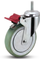
Total Lock Red pedal.