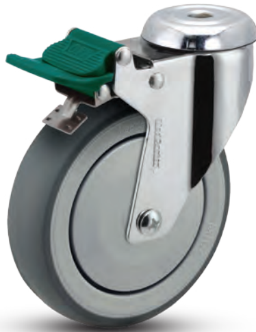
Thermoplastic rubber wheel with direction lock SX-05TPX-125-DL-HK01