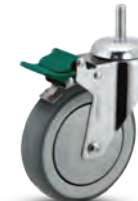
Direction Lock Green pedal.

Stems ship with a loose bolt for easier alignment of the directional lock.