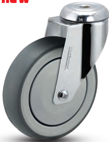
Thermoplastic rubber wheel SX-05TPX-125-SW-HK01