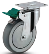
Direction Lock Green pedal.