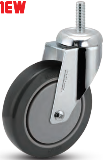
Polyurethane TPU wheel SX-05PYX-125-SW-TS02