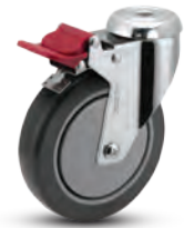
Total Lock Red pedal.