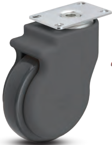
Free swivel model CP-05PYP-125-SW-TP13G

FREE SWIVEL • TOTAL LOCK • DIRECTION LOCK