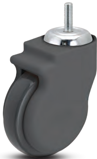
Free swivel model CP-05PYP-125-SW-TS02G

HOLLOW KINGPIN MODELS FREE SWIVEL • TOTAL LOCK • DIRECTION LOCK