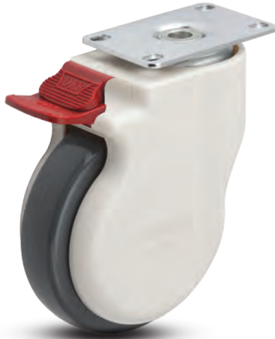
Total lock model CP-05PYP-125-TL-TP13W