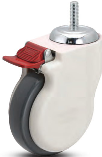
Total lock model CP-05PYP-125-TL-TS02W