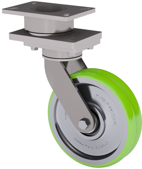
Item Shown: SP13062321